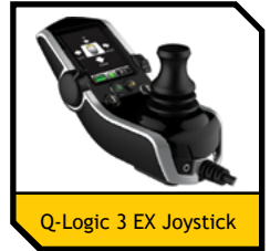
Q-Logic 3 EX Joystick