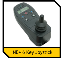
NE+ 6 Key Joystick