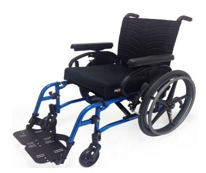
Quickie QX featuring the Jay X2™ cushion