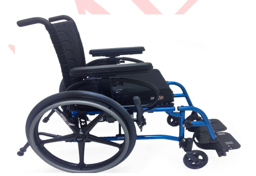
Quickie QX, Ultra Lightweight Folding Wheelchair