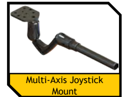
Multi-Axis Joystick Mount