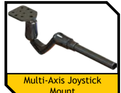
Multi-Axis Joystick Mount