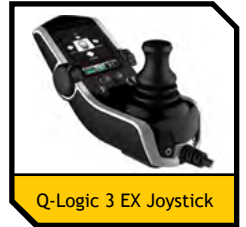
Q-Logic 3 EX Joystick