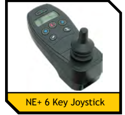
NE+ 6 Key Joystick